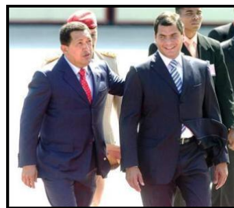
Hugo Chavez and Rafael Correa.