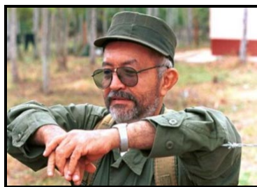
FARC’s Raul Reyes.

said. “Everything has been accessed and everything is being validated by Interpol,” Mr. Santos said, adding that he expected the work on the validation to be completed by the end of April. “It is a great deal of information that is extremely valuable and important.” One file recovered from Mr. Devia’s computers, dated a week earlier on Jan. 18, 2007, and described efforts by the FARC’s secretariat to secure Mr. Chávez’s assistance for buying arms and obtaining a $250 million loan, “to be paid when we take power.” The FARC, a Marxist-inspired insurgency that has persisted for four decades, finances itself largely through cocaine trafficking and kidnappings for ransom. But other files from the computers suggested that Colombia’s counterinsurgency effort, financed in large part by $600 million a year in aid from Washington, was making those activities less lucrative for the FARC, forcing it to consider options like selling Venezuelan gasoline at a profit in Colombia. http://www.nytimes.com/2008/03/30/world/americas/30colombia.html?_r=1&pagewanted=all&oref=slogin