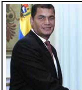
President Rafael Correa.

The FARC reportedly contributed with up to $100,000 to the campaign of Ecuadorian President Rafael Correa. The popular magazine Semana said documents discovered on the laptop computer of slain Colombian rebel leader Raul Reyes showed his Revolutionary Armed Forces of Colombia, or FARC, donated the money ahead of Correa's 2006 election. The files, which Venezuela and Ecuador have dismissed as fakes, were filled with revolutionary jargon, passages in numerical code, missives about U.S. policy in Latin America and even brief personal reflections. The files are expected to haunt relations between Colombia, Ecuador and Venezuela for some time. For instance, one file, dated Nov. 21, 2006, describes a supposed FARC donation to the presidential campaign of Correa in Ecuador.