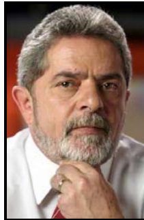
Inacio Lula da Silva.

A recent survey has showed that the Brazilian government led by President Luiz Inacio Lula da Silva has won unprecedented public support to become the most popular administration since the survey was first carried out in 1990. In a poll conducted by the Institute Datafolha and released Monday, Lula's government was credited as “excellent or good” by 55 percent of those interviewed, which surpassed all the previous administrations since the government of Fernando Collor de Mello (1990-1992), Brazil's first democratically-elected president after the end of the country's military rule. The latest survey also saw a 5-percent increase in the government's approval rate from the previous figure of 50 percent, from a survey conducted in November 2007.