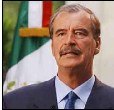
Former Mexican President Vicente Fox.

eye surgeries (...) All of this with a view to win those countries in order to continue to encourage the axis with which he aspires to become the heir (of Cuban leader) Fidel Castro, and become the 21st-century Fidel Castro.”