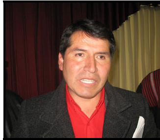
Hernan Fuentes, the regional president, or governor, of the province of Puno.

union. Meanwhile, ALBA houses have proliferated in Peru's southern highlands, serving as dissemination points for chavismo . Government officials say that these so-called “anti-poverty centers” have sprung up across Peru to promote political agitation which may have fueled protests against the government’s free market economic policies. Many centers were linked to a radical leftist organization known as the Continental Bolivarian Committee. 2