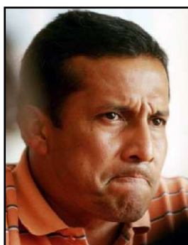
Former Peruvian Presidential Candidate, Chavista Ollanta Humala.