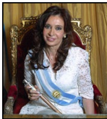
Cristina Fernández de Kirchner.